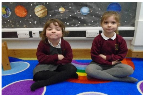
We are the Reception representatives.

Here are your school councillors for 2020. They are always available to help out if you need it. Please keep up to date with what we are doing by looking at our display board in school outside the Main Hall.