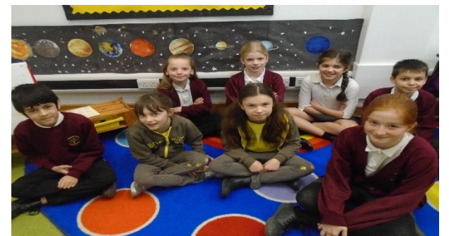
We are the Key Stage Two representatives.