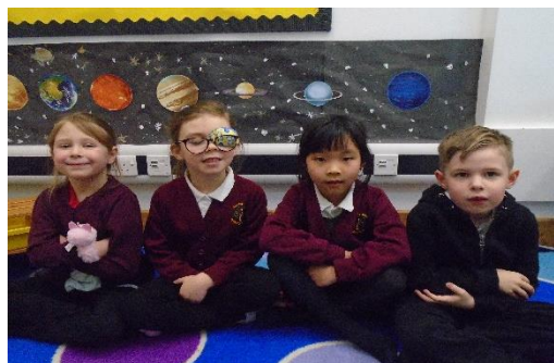
We are the Key Stage One representatives.